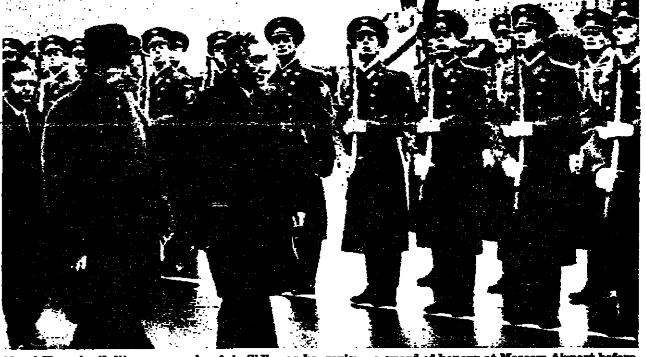
Alaral Kosygin (left), accompanies Aziz Sidky as he reviews a guard of honour at Moscow Airport before his departure.